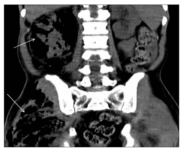
Figure 6: Non-contrast CT (reformatted coronal) showing right-sided (emphysematous pyelonephritis class IIIb) with extension of gas to the perinephric space and in to thigh muscle (arrows)