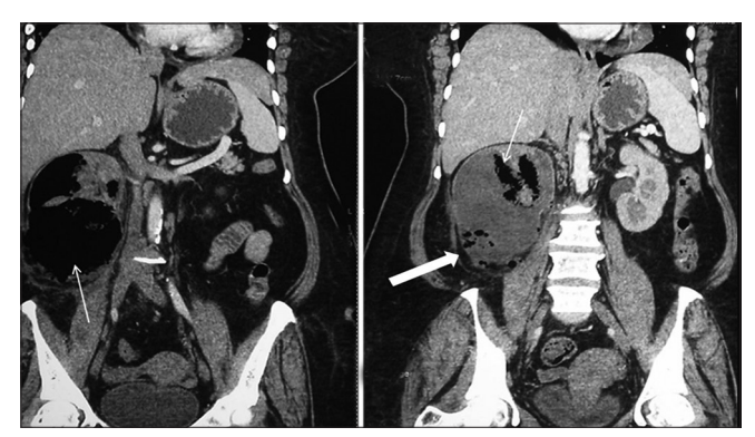
Figure 5: Non-contrast CT (reformatted coronal) showing gas in the right renal parenchyma extending into perinephric space (emphysematous pyelonephritis class Illa) (arrows)

ureter/pelvicalyceal system; Class II - gas in renal parenchyma; Class III – gas in renal parenchyma extending beyond the fascia to perinephric (IIIa/pararenal spaces IIIb); and Class IV - bilateral EPN or EPN in solitary kidney.