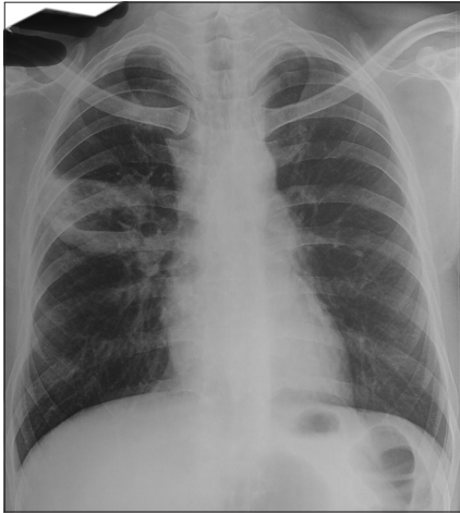
Figure 1: X-ray chest showing right mid zone cavitory lesion

the dose of tacrolimus was decreased keeping the blood tacrolimus levels in the therapeutic range and showed clinical and radiological improvement [Figure 3]. Before starting fluconazole, he was receiving tacrolimus 2 mg twice a day that had to be decreased to 0.5 mg twice a day.