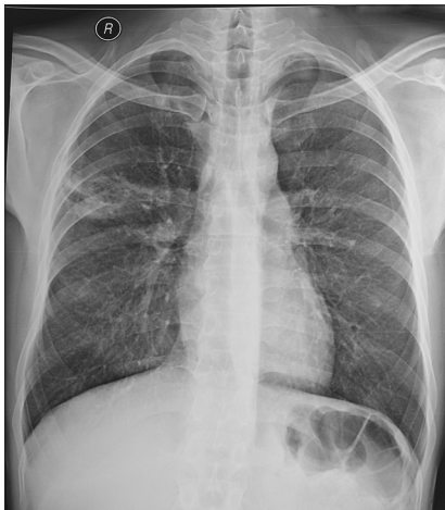
Figure 3: X-ray showing clearing of right cavitory lesion on treatment