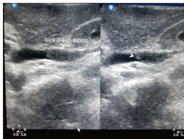
Figure 1: Ultrasonography study showing Right Renal Vein Thrombosis

Ultrasonography of Abdomen showed normal sized kidneys with grade 1 echogenicity with normal CMD with normal liver, spleen and pancreas. No pelvic mass was seen. Renal Doppler [Figure 3] showed right renal vein thrombosis. Chest X-ray was suggestive of opacities in both lower zones, MRI spine showed no evidence of nerve root compression or changes suggestive of Potts spine. She was diagnosed as having anti MPO-AAV with renal vein thrombosis. Anti-Tb treatment was stopped and she was