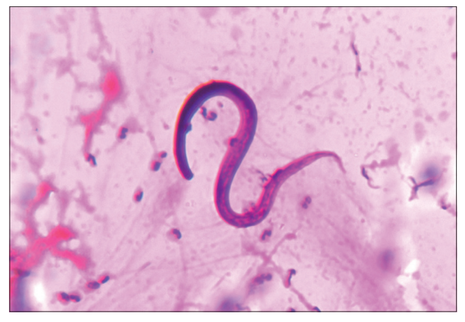
Figure 3: Bronchoalveolar lavage fluid showing strongyloid larvae

and serial chest X-ray showed gradual improvement. Subsequently, he developed right lung consolidation, and repeat blood culture showed Chryseomonas growth. The patient remained sick and ventilator dependent. He finally succumbed to secondary bacterial infection after 2 weeks of admission.