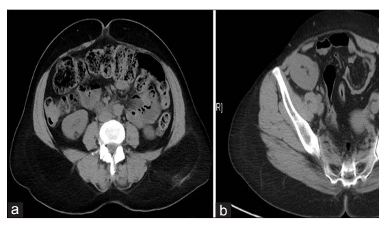
Figure 1: (a) Multidetector computerized tomography showing fat attenuating nodule of size 14 mm × 10 mm in the right kidney of donor consistent with angiomyolipoma. (b) Multidetector computerized tomography done after 5 years showing with angiomyolipoma of size 15 mm × 10 mm in the renal allograft

TSC is an autosomal dominant disorder characterized by the development of hamartomas in the brain, skin, heart, and kidneys.[2] In TSC, AMLs are usually small, multiple, bilateral with equal sex distribution, and their prevalence is age-related.[3] In patients with TSC, ESRD is uncommon except in massive bilateral renal involvement and associated cystic disease.[4]