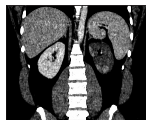
Figure 1: CT angiography with pyelogram: Showing infarcted left kidney (blue arrow)

Renal artery thrombosis is a rare clinical condition. The common causes of renal artery thrombosis are atrial fibrillation, renal artery trauma, endovascular revascularisation, infective endocarditis, and hypercoagulable states due to APLA antibodies, factor V Leiden mutation, protein C/S mutation and hyperhomocysteinemia. In a retrospective series of 38 patients together with a pooled analysis of 127 patients from separate previous reports (total of 165 patients), the most common cause for renal infarction was atrial fibrillation (37%) followed by coagulopathy and bacterial endocarditis.<sup>[1]</sup> In another multicentre retrospective study of 94 patients, which included patients between 1989 and 2011, the hypercoagulable group contained 15 patients with hereditary thrombophilia (16%, n = 6), hyperhomocysteinemia (n = 4), antiphospholipid syndrome (n = 4).<sup>[2]</sup> The diagnosis of renal artery thrombosis and renal infarction is usually not apparent because it can present as many other pathologic conditions like pyelonephritis, renal colic, acute abdomen, rupture of an aortic aneurysm etc. CT