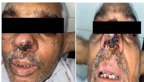
Figure 1: Necrotic lesion measuring 1.5 \times 1 cm on nasal tip over columella extending to left nasal ala, septum, and bilateral vestibule. Overlying skin was erythematous and showed crusting. It was nontender and had no pus discharge or bleeding. Fungal potassium hydroxide (KOH) mount was negative for mucormycosis and was suggestive of acute inflammatory exudate without any granuloma formation.

A 60-year-old male presented with painless necrotic lesion over the tip of nose [Figure 1]. There was grade 1 pedal edema and submandibular lymphadenopathy. At admission, the serum creatinine was 5.96 mg/dl. He was found to have raised blood sugar, raising suspicions of mucormycosis. Fungal potassium hydroxide (KOH) mount of scrapings from the lesion was negative and had acute inflammatory exudate without granulomas. There were no active urine sediments or hypertension. Autoimmune vasculitis and myeloma workup were negative. Bedside ultrasonography showed bilateral bulky kidneys without hydronephrosis or renal mass. A complete blood count revealed a total leucocyte count of 40.6 \times 10^3/\mu\text{L} . Workup for infiltrative disorders was sent, and a kidney biopsy was done given unexplained acute kidney injury (AKI). Peripheral blood smear had 18% blast and blast-like cells raising a possibility of acute leukemia.