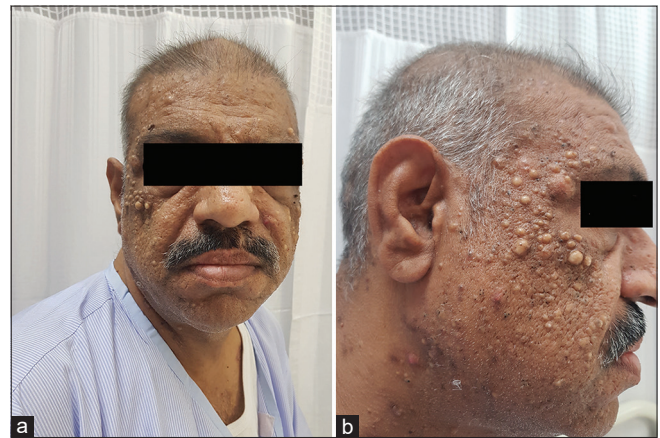
Figure 2: (a and b): Characteristic epidermoid cysts over the face