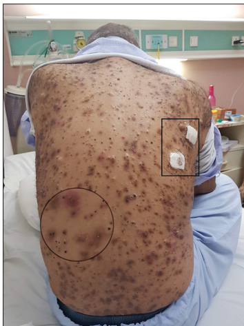
Figure 1: Multiple papulonodular lesions with characteristic "punctum" over the back. Healed dark brown scars along with tender erythematous nodules (Inset). A white bandage is seen overlying the skin biopsy site (Box)

Tacrolimus though differs from cyclosporine in chemical structure, its mechanism of action is similar. Both are CNIs and act by inhibition of dephosphorylation of the nuclear factor of activated T cells (NFAT) thereby inhibiting the downward signaling and lymphocyte proliferation. Tacrolimus, due to its potent T-cell inhibition and keratinocyte apoptosis inhibition, is indicated in certain dermatological conditions such as atopic dermatosis.