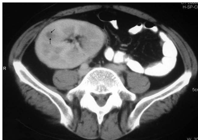
Figure 1: CT scan showing a hypodense lesion in the allograft

His hemoglobin was 9.2 g/dl, total leukocyte count 2400/mm 3 , platelet count of 160 × 10 3 /mm 3 , erythrocyte sedimentation rate 30 mm/1 st hour, serum creatinine was 1 mg/dl, sodium 142 mEq/L, potassium 4.7 mEq/L, serum bilirubin 0.73 mg/dl, aspartate aminotransferase 40 IU/L, alanine aminotransferase 26 IU/L, alkaline phosphatase 446 IU/L, serum total protein 7.5 g/dl, serum albumin 3.4 g/dl and the fasting serum glucose was 104 mg/dl. Ultrasonography of the abdomen revealed 5 × 6 cm hypo-echoic lesion in segment V of the liver. A contrast-enhanced computed tomographic scan of the thorax and abdomen revealed multiple, confluent hypodense lesions in the liver, spleen, the renal allograft [Figure 1] and prostate [Figure 2], along with multiple enlarged lymph nodes in the mesentery with central necrosis. The prostate