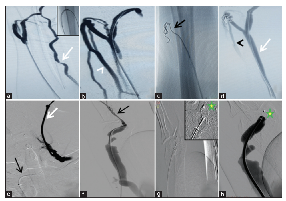
Figure 3: (a-d): Accessory vein embolization. (a) Fistulogram shows retrograde filling of radial artery (arrow) with juxta-anastomotic stenosis. (b) Post balloon angioplasty check run shows that AVF flow but diverted into collateral veins via large accessory vein (arrowhead). (c and d) Accessory vein coiling (arrow, c) with restoration of flow in cephalic vein (white arrow, d). (e-h) Flow reduction procedure. (e) Left brachiocephalic vein occlusion, failed recanalization via jugular (white arrow) and femoral (black arrow) routes. (f) Fistulogram shows normal flow across left BCF. (g) Vascular plug deployed in outflow vein at the juxta-anastomotic segment (inset with star). (h) Post partial embolization fistulogram shows forward flow suggestive of patent AVF