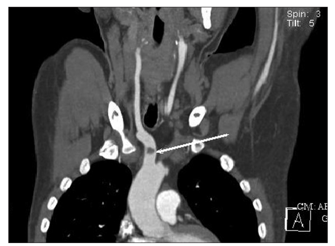
Figure 1b: Contrast-enhanced MDCT of neck and thorax, showing partial occlusion of right brachiocephalic trunk (arrow) with thrombus (coronal section)