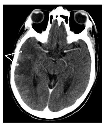
Figure 2: CT scan head shows right MCA territory infarction (arrows)