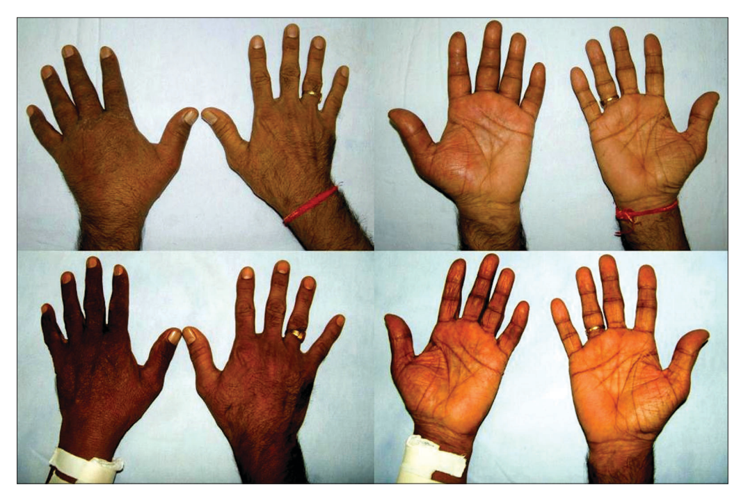
Fig. 1: ABOVE: Swelling of the left hand with venous congestion of distal palm and fingers, BELOW: The swelling and congestion are not seen postoperatively

Subclavian, axillary, and proximal cephalic vein stenosis was ruled out with a Doppler study. Angiography was not attempted due to a high risk of radiocontrast-induced nephropathy.