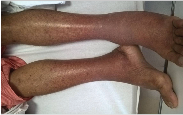
Figure 1: Erythematous maculopapular rash on the extensor surface of lower extremities

with foci of chronic mononuclear inflammatory infiltrate. Immunofluorescence showed strong granular staining for C3, IgG and IgM along the capillary wall and in mesangial areas. Electron microscopy (EM) could not be done. A diagnosis of immune-complex mediated MPGN pattern was made.