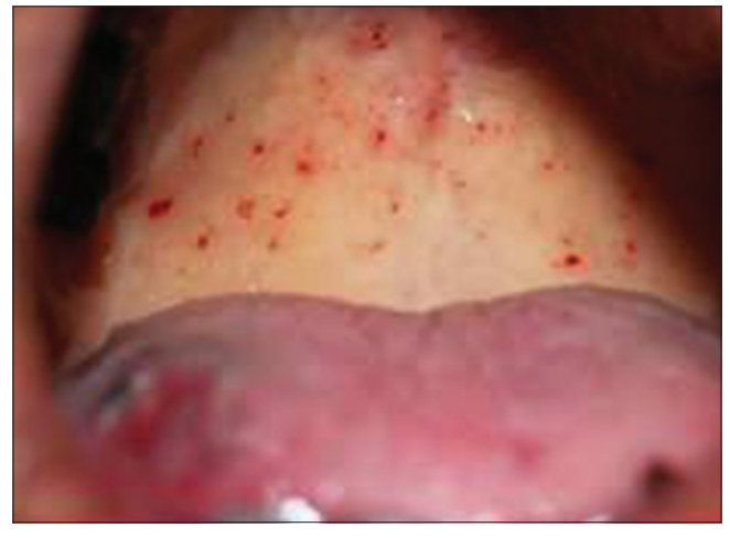
Figure 3: Petechiae present at hard and soft palate

present in the renal patients. Uremic frost is a condition when urea and urea derivatives are secreted through the saliva in oral cavity and sweat in skin, which evaporates away and may leave solid uric compounds, resembling a frost [Figure 4].<sup>[16,17]</sup>