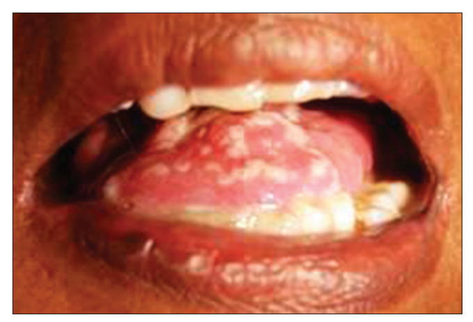
Figure 5: Psuedomembranous candidiasis affecting tongue