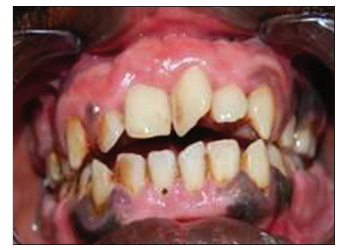
Figure 1: Gingival enlargement following cyclosporine therapy

Uremic frost, an uncommon clinical observation associated to azotemia and uremia may occasionally be