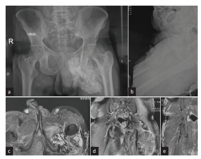
Figure 1: (a) X-ray pelvis anteroposterior and (b) lateral view depicting heterogenous fluffy opacity involving soft tissues of left side of inferior aspect of left hemi-pelvis and medial aspect of upper thigh, overlying ischial bones, extending up to left side hemi-scrotum. Magnetic resonance imaging (MRI) Pelvis with (c) contrast axial and (d) and (e) coronal view depicts large multilobulated septate cystic, partly solid soft tissue mass in proximal thigh & adjacent buttock surrounding posterior aspect of intertrochanteric and proximal shaft of femur. Septate cystic area was hypointense in T1, and hypo to hyperintense in T2 with multiple air fluid level showing dependent calcium. There was post-contrast patchy peripheral enhancement of the mass.

A 39-year-old male, born out of a consanguineous marriage, first noticed a lump at his left hip at the age of 10 years. An excision biopsy revealed fibro-collagenous tissue with multiple calcific deposits with lymphoplasmacytic infiltrates, and he was diagnosed to have TC based on radiological and histopathological findings. No family history of similar illness was present. He was found to have hyperphosphatemia with normal serum calcium levels. On further evaluation, his 25-hydroxy vitamin D was found to be 44 nmol/L, intact parathormone (iPTH) 5 pg/ mL, and FGF-23 13 RU/mL (reference: 0-150). His blood sugar and renal function were within normal range. He was started on acetazolamide, but his serum phosphorus levels remained high (ranging 5-7 mg/dL). For the next 30 years, he continued to develop soft-tissue calcification in different body areas. He subsequently underwent corrective surgeries and remained on a low-phosphate diet, acetazolamide, and aluminum hydroxide.