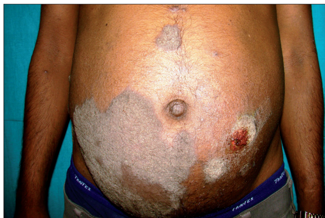
Figure 1: Crusted skin lesions over the abdomen

Crusted scabies, a fulminant and highly infectious form, results from a failure of the host immune response to control the proliferation of the scabies mite in the skin, thus causing hyperinfestation. It has also been hypothesized that the crusted response to infection results from a tendency to preferentially mount a Th2 response. [3] A population density of 6,312 mites/g was demonstrated in the dust from bed linen of such a patient. [4] Crusted scabies occurs with increased frequency among patients with leukemia, HIV infection, Down's syndrome, lepromatous leprosy and diabetes. [4,5]