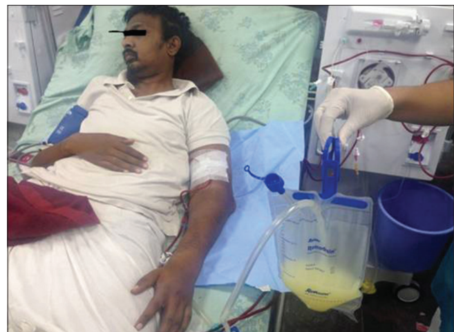
Figure 3: Patient with severe venous edema of the left upper limb and chylous pleural effusion

is bacteriostatic. The chylous pleural effusion was completely treated by combined angioplasty and pleural drainage.