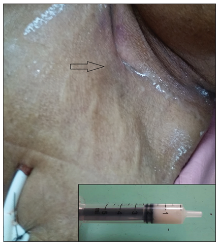
Figure 1: Discharge from the venotomy site in the left supraclavicular fossa. Insert: milky fluid aspirated from skin surface in the syringe before sending for investigation