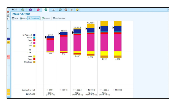
Figure 1: Increasingly positive hypervolemia, mostly from IV fluid therapy, despite combination of IV diuretics. IV: Intravenous.

Due to persistent hyperkalemia, hyponatremia, and hyperphosphatemia, she had an urgent three-hour hemodialysis (HD) treatment with ultrafiltration two days post-operation. She did not need any additional HD. Serum creatinine was at 1.52 mg/dL two weeks post-transplantation [Figure 2].