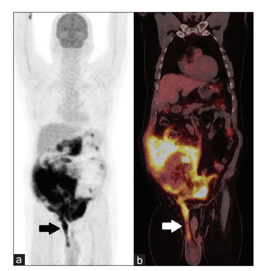
Figure 1: Baseline (a) 18-fluorodeoxyglucose positron emission tomography-computed tomography maximum intensity projection reconstruction of computed tomography attenuation corrected image and (b) 18-fluorodeoxyglucose positron emission tomography-computed tomography (fused) coronal reconstruction image revealing intensely fluorodeoxyglucose-avid primary lesion encasing the transplanted kidney, invading the adjacent ascending colon, cecum, and distal part of ileum. The lesion is also extending in right inguinal canal (arrow)

PTLD is a heterogeneous group of lymphoproliferative diseases ranging from hyperplastic lesions to polymorphic and monomorphic lesions that occur in the setting of solid organ or allogeneic hematopoietic cell transplantation. Risk factors include EBV infection, human leukocyte antigen mismatching, and T-cell depletion. It is the most