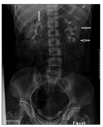
Figure 3: Intra venous pyelogram: (Delayed films) White arrowheads showing accumulation of contrast agent in the ectatic renal collecting tubule in the pyramids and linear striations of contrast material radiating outward from the calvees (paintbrushlike appearance); black arrow heads showing the papillary blush