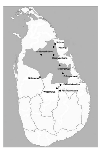
Figure 1: A map of Sri Lanka showing areas known to be endemic for chronic kidney disease of unknown etiology. The shaded area is the North Central Province

there is an evidence suggesting that the disease is due to exposure to an environmental toxin.<sup>[4,6]</sup> Some of the etiological factors under investigation are consumption of pesticide contaminated water,<sup>[7]</sup> high concentration of fluoride in ground water<sup>[2,8]</sup> and other heavy metals such as cadmium and arsenic.<sup>[2,5,9-11]</sup> Ochratoxin A, a well-known nephrotoxin has been identified as an unlikely association.<sup>[12]</sup>