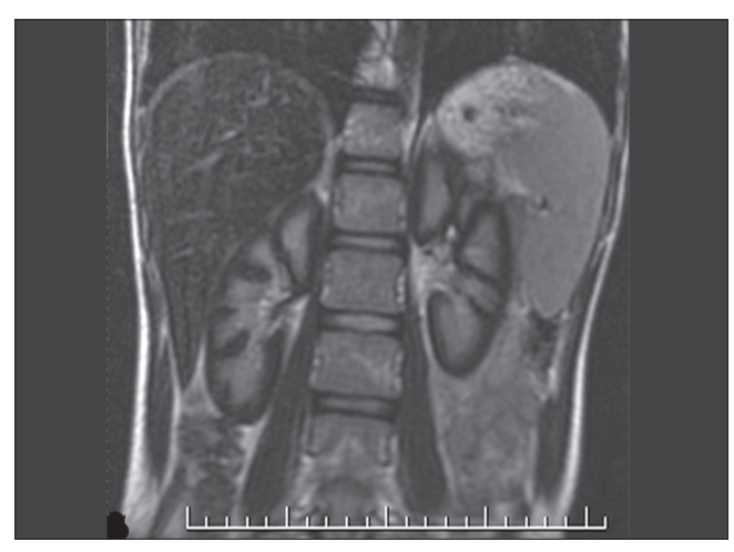
Figure 2: Fast spin echo (FSE) T2-weighted coronal image shows hypointense signal of bilateral renal cortices. The renal medulla is normal