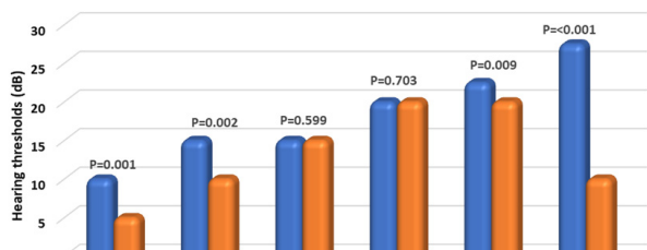
Figure 1: Comparison of median hearing threshold in dB between transplant group and control as regards different HZ using pure-tone audiometry. P value was computed by Mann-Whitney U test.

Data were expressed by N (%), mean ± SD, median (minimum-maximum). *P value was computed by independent samples t-test. **P value was computed by Mann-Whitney U test. ***P value was computed by Chi-square test. The bold values denote that these values are statistically significant.