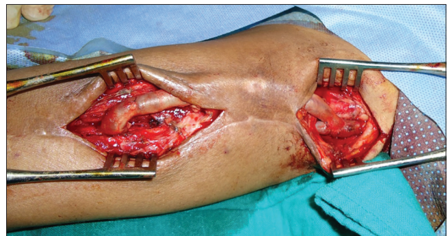
Figure 1: Intraoperative view of right brachial artery-axillary vein translocated superficial femoral vein

hemodialysis. [1] This recommendation is based on studies that demonstrate enhanced patency for AVF compared with grafts. This preference for a native AVF has led many to perform some innovative access operations. Transposition of the brachial vein reported by Bazan and Shanzer [2] is characterized by a high incidence of complications and a long period to achieve maturation. Despite close monitoring and a high rate of secondary interventions, the patency rate was low. [3] Reported series of lower-extremity AV access have documented relatively poor patency rates and a high incidence of infection. [4] The use of autogenous saphenous vein for AVF in the thigh has met with limited success. Patency rates of 40% at 3 years, and fragility (two fatal bleeding