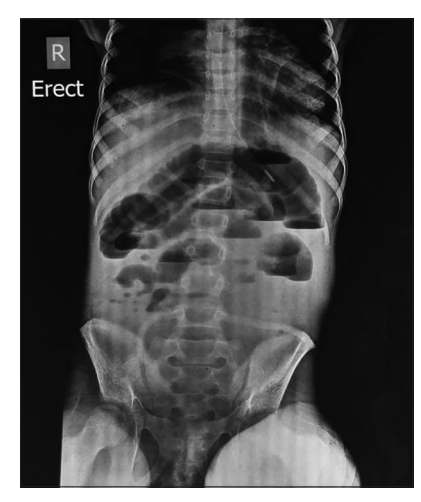
Figure 1: X-ray abdomen showing multiple air fluid levels

of tubulo-reticular body [Figure 2].The histopathologic diagnosis was membranous lupus nephritis class V according to the International Society of Nephrology (ISN)/ Renal Pathology Society (RPS).