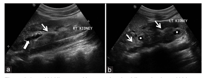
Figure 1: (a and b) Ultrasound images showing bilateral enlarged kidneys, echogenic medullary regions (arrows), cortical cysts (asterix) and caliectasis (arrowhead)

Access this article online Quick Response Code: Website: www.indianjnephrol.org DOI: 10.4103/0971-4065.150079