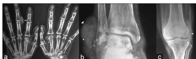
Figure 3: (a) Left panel – soft tissue calcific deposit over the left middle proximal interphalangeal joint (pointed by arrow) and at distal second metacarpal of the right hand (pointed by arrowhead), (b) middle panel – chalky white calcific deposits behind the right fibula (arrow) and diffuse subcutaneous collection of deposits (arrowheads), (c) right panel – calcific deposit overlying lateral side of the left knee joint (arrow)