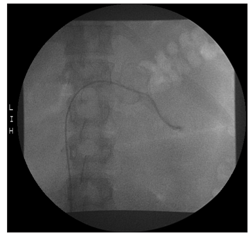
Figure 2: Renal venogram showing the left renal vein with a large occlusive thrombus involving the central 5 cm of the left renal vein with thrombus extending into the inferior vena cava

Her renal function continued to worsen (Cr 1.76 mg/dL) and as a result her diuretics were held and she was