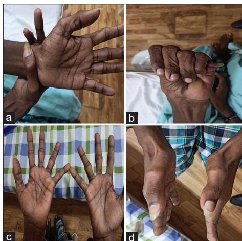
Figure 1: Morphological features; (a) Wrist sign, (b) Thumb sign, (c) Distal muscle wasting, (d) Arachnodactyly

A tentative diagnosis of GS was made on the findings of hypokalemia, renal potassium wasting, hypomagnesemia, renal magnesium wasting, metabolic alkalosis, relatively low urine calcium excretion in a normotensive adult. A diagnosis of GD was made based on hyperthyroidism with low serum TSH levels and the presence of anti-TSH receptor antibodies.